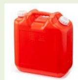
Plastic kerosene container

What do I need when buying or refilling the appliance with kerosene ?