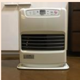
Kerosene fan heater