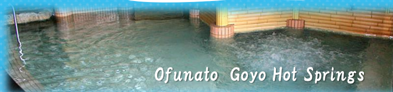
Ofunato Goyo Hot Springs

※If it is not possible to board due to bad weather, we will pick lavender and do crafts.